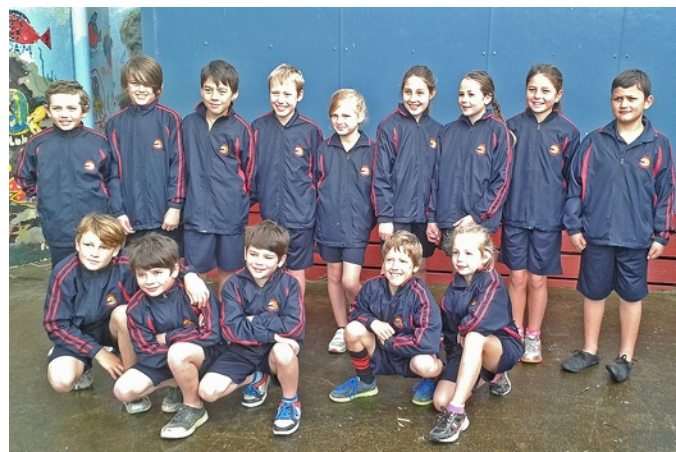
Orere School Cross-Country Team